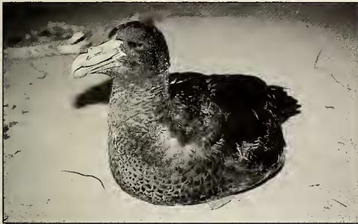
Southern Giant Petrel Macronectes giganteus, Mahe, August 1992

The Seychelles Bird Records Committee is sponsored by Cousine Island.